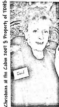
Christmas at the Cabin 2007 & Property of TDHS