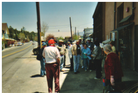
View of Jibboom Street looking eastbound § Elder Hostel Tour 6.18.07 § Photo property of TDHS

In honoring the renaming Main Street to its historically accurate Jibboom Street, we experience again how history in its completeness can be indelicate, even bawdy (another word that derives from prostitution). Truckee never was a shy place in its days of railroads, logging, or ice harvesting. Authentic retelling of our past might even make a sailor blush.