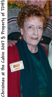
Christmas at the Cabin 2007