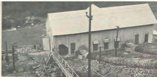
FIGURE 13.—Eastward view of small powerhouse at Farad on Truckee River 3 miles east of Boca Reservoir, showing near-circular hole about 9 ft in diameter punctured in brick wall (lower left) by large falling boulder. Boulder fell from slope about 100 ft west of Interstate Highway 80 (behind viewer), skipped across the highway and the catwalk (left foreground), and bounced near base of power pole in center and then into the brick wall.

And lastly, there is a reference in a December 25, 1981 article to a purported "Truckee Fault" which supposedly runs through downtown Truckee near the Tahoe Forest Hospital's heliport area, but is generally presumed to be an offshoot of the Dog Valley Fault. A 1974 study compiled by Gasch and Associates of Sacramento concluded that an active fault does pass very near the hospital. However, this fault was not documented on a Division of Mines and Geology state fault map at that time.