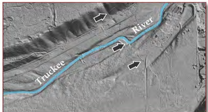
LiDAR image

The second image is provided by the U.S. Army Corps of Engineers which shows this newly discovered POLARIS fault which was discovered using the LiDAR technology.