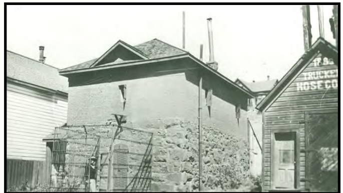
Old Truckee Jail about 1908; Photos, above and left , courtesy of Truckee Donner Historical Society