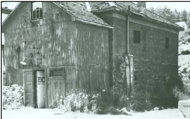
Old Truckee Jail in mid-1960s

Please get involved with your Truckee Donner Historical Society (TDHS). The only way we can offer programs and events is if YOU, as a volunteer, step up and get involved. TDHS is an all-volunteer, 501(c)(3) organization so any and all donations are gratefully appreciated and tax deductible. Our mailing address is Truckee Donner Historical Society, P.O. Box 893, Truckee, CA 96160.