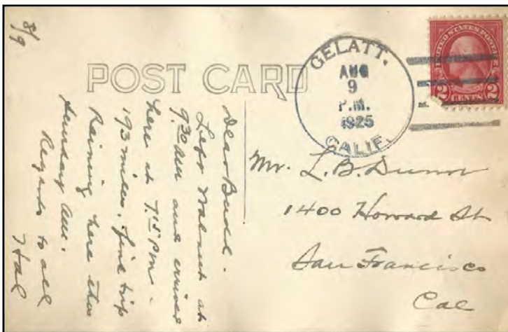
Top, front of postcard; Bottom, back of postcard stamped Gelatt, Calif. Aug 9, P.M., 1925