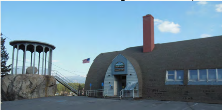
Veterans Memorial Building.